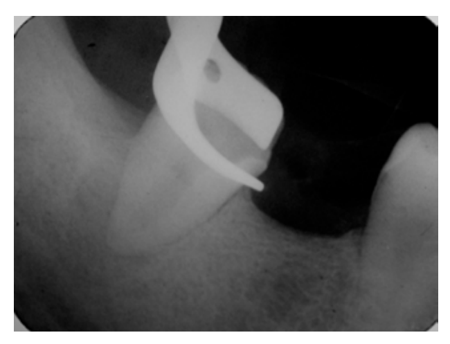
Figure 1 - Initial radiographic appearance of the mandibular second molar.

A 40-year-old man was referred at the clinics of the School of Dentistry with sensibility on mastication in the mandibular second molar (47). The intraoral examination showed that tooth had carious cavity and the cold thermal pulp testing detected endodontic alteration, represented by the absence of pulp vitality. Radiographic examination revealed the extent of carious lesions by the mesial aspect of the second molar, where one can also observe the root of this condition without the presence of periapical lesion, but with slight increase of the apical periodontal space (Figure 1).