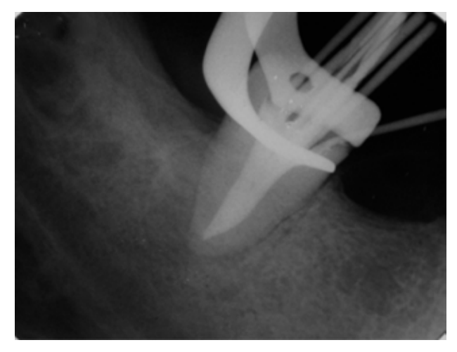
Figure 5 - Radiographic aspect of the root canal filling.

In the second session, after thorough preparation, it was removed the calcium hydroxide and applied a demineralizing solution (17% EDTA, Biodinâmica, Ibiporã, PR, Brazil), which was left inside the root canal for 2 min and subsequently removed with the use of sodium hypochlorite irrigation. Drying of the root canal was made with absorbent paper points. Then, the three master cones were adapted (Dentsply Rio de Janeiro, RJ, Brazil) and the root canal obturation was carried out by lateral condensation and guttapercha thermoplastification technique using the McSpadden compactor with root canal sealer Endofill (Dentsply, Rio de Janeiro, RJ, Brazil) (Figures 4 and 5). After root canal obturation, the tooth was sealed with resin-modified glass ionomer cement (Vitremer, 3M Dental Products Division, St. Paul, MN, USA) (Figure 6).