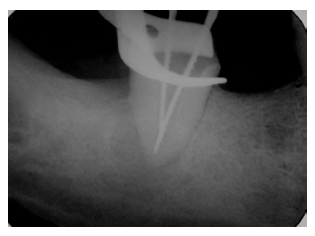
Figure 3 - Establishment of limits for the treatment.

canal (Figure 3), and after that, the canal was instrumented with the K-file #80 (Dentsply-Maillefer, Ballaigues, Switzerland), by making movements of filling around the walls of the root canal, with intermittent irrigation by use of approximately 15 ml of sodium hypochlorite 2.5%. After use of the file #80, gates-glidden drills (#4 and #5) were used, providing taper