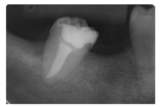
Figure 9 - Final radiographic aspect.

Twelve months after the conclusion of the treatment, the clinical and radiographic (Figure 6) follow-up revealed that endodontic treatment and direct restoration have a suitable clinical characteristic.