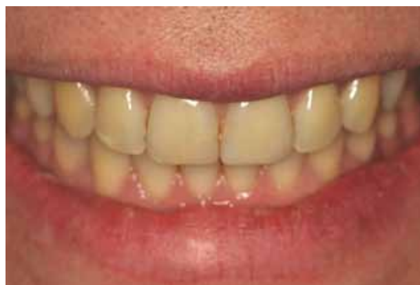
Figure 1 - Opaque and unsatisfactory Class IV restorations placed on teeth 11 and 21.

Male patient, 32 years old, sought care at the clinic of Dentistry, Bauru School of Dentistry, University of São Paulo, reporting esthetic dissatisfaction related to the general darkening of teeth after orthodontic treatment. Two Class IV restorations placed on teeth 11 and 21 (Figure 1) were opaque and unsatisfactory. From a palatal view, infiltration in the margins could be observed (Figure 2), indicating the need for replacement of the restorations. The treatment plan should involve teeth bleaching and subsequent replacement of the Class IV restorations.