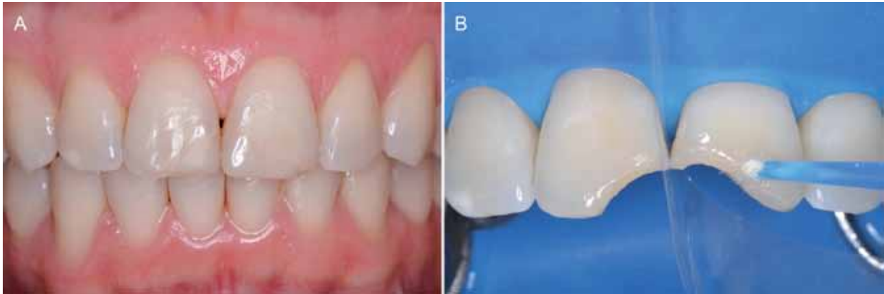
Figure 4 - A) After the bleaching: finalcolor of teeth (A1) with Vita scale (VITA Zahnfabrik) B) Unsatisfactory restorations were removed and the SB was applied for 5 min.