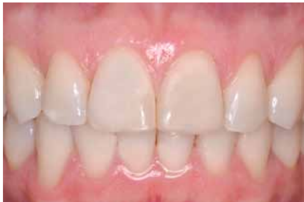
Figure 7 - After one year; restorations remained stable and satisfactory.