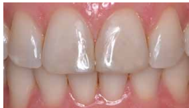
Figure 6 - Final results.