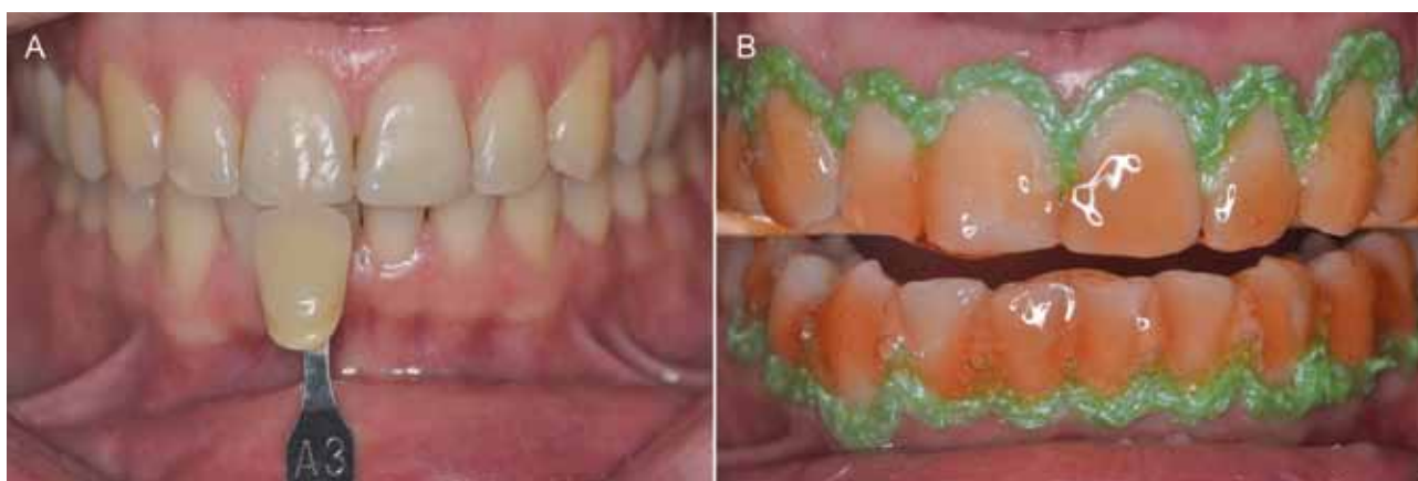
Figure 3 - A) Initial color of teeth (A3) with Vita scale (VITA Zahnfabrik); B) Teeth bleaching with 37 % hydrogen peroxide performed in 2 sessions of 3 applications of 12 min each.

Due to aesthetic demands of the patient who would not accept to wait seven days for the replacement of the restorations, the SB apply were performed in an attempt to improve the condition of the enamel surface to receive the adhesive system immediately. Thereby, the unsatisfactory restorations in 11 and 21 were totally removed and enamel surface were air-dried. Sodium bicarbonate solution (SB) (Neutralize solution, DMC) that was available in-office bleaching kit were applied with a microbrush applicator by 5 min timeout (Figure 4). SB were removed and the surface was cleaned and dried.