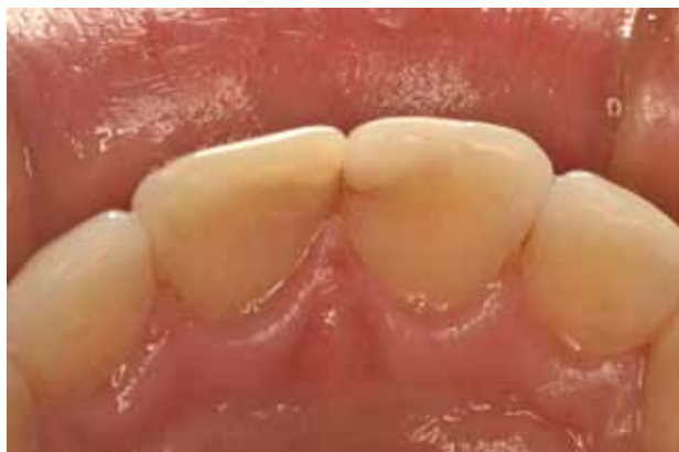
Figure 2 - Palatal view: infiltration in the margins.