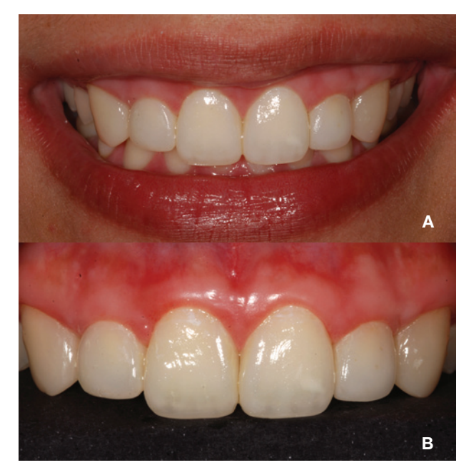
Figure 10 - a) After 36 months of the treatment was verified the color stability and the maintenance of the esthetic form. b) Close up smile view after 36 months.