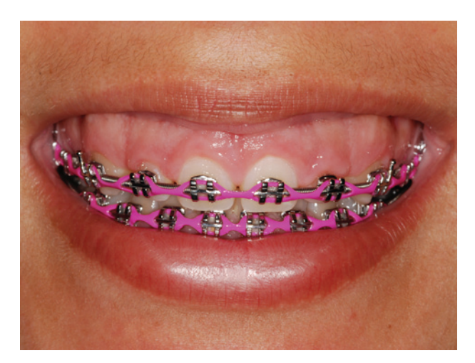
Figure 1 - Patient's smile showing the presence of anterior diastemata and gingival smile.

Complaints about harmony smile, especially about the presence of anterior diastemata that remained even after the orthodontic treatment and gingival smile, are frequent (Figure 1).