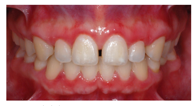
Figure 5 - a) b) c) After 21 days the surgery was done in the maxillary arch, the same procedure was performed in the lower arch.

Improving teeth aesthetics, bleaching treatment can be done, certainly, before closing anterior diastema with composite resin. The in-office bleaching performed with hybrid light, using hydrogen peroxide can present some advantages (Figures 6a and 6b), as