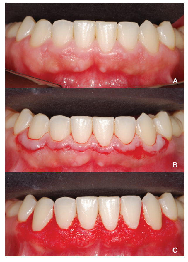
Figure 4 - a) b) c) After 21 days the surgery was done in the maxillary arch, the same procedure was performed in the lower arch.

Gingivoplasty can be performed, according to the technique described by Goldman in 1951, which determines the removal of gingival sulcus corresponding the measurement obtained during the clinical periodontal probing [4]. Commonly, after 21 days of completion the operation in the maxillary arch, the same procedure for the removal the false pockets in lower arch, can be performed (Figures 3 to 5).