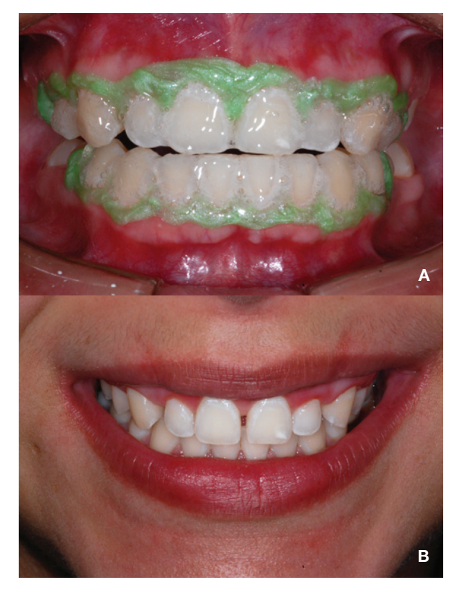
Figure 6 - a) Dental in-office bleaching was performed using hydrogen peroxide at a high concentration. b) Result obtained immediately after the in-office bleaching.

the simplicity and easy applicability, allows treatment control and possible compromises, for being held in short clinical time and in several teeth simultaneously, in addition presents initial good results and prognosis.