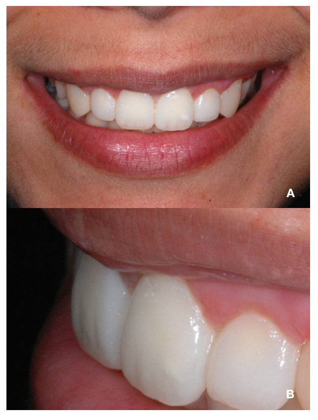
Figure 9 - a) Final esthetic outcome of the smile. b) Close up and lateral view of the smile.

Direct resin composite restorations have become an important tool in dentistry, especially for healthy teeth that need aesthetic correction with a maximal tooth-saving approach. Patients and dentists can benefit from the numerous advantages offered by this treatment option: tooth shape, color, and position can be corrected with an immediate restoration in one treatment session; the technique is non-invasive or minimally invasive; the technique is reversible,