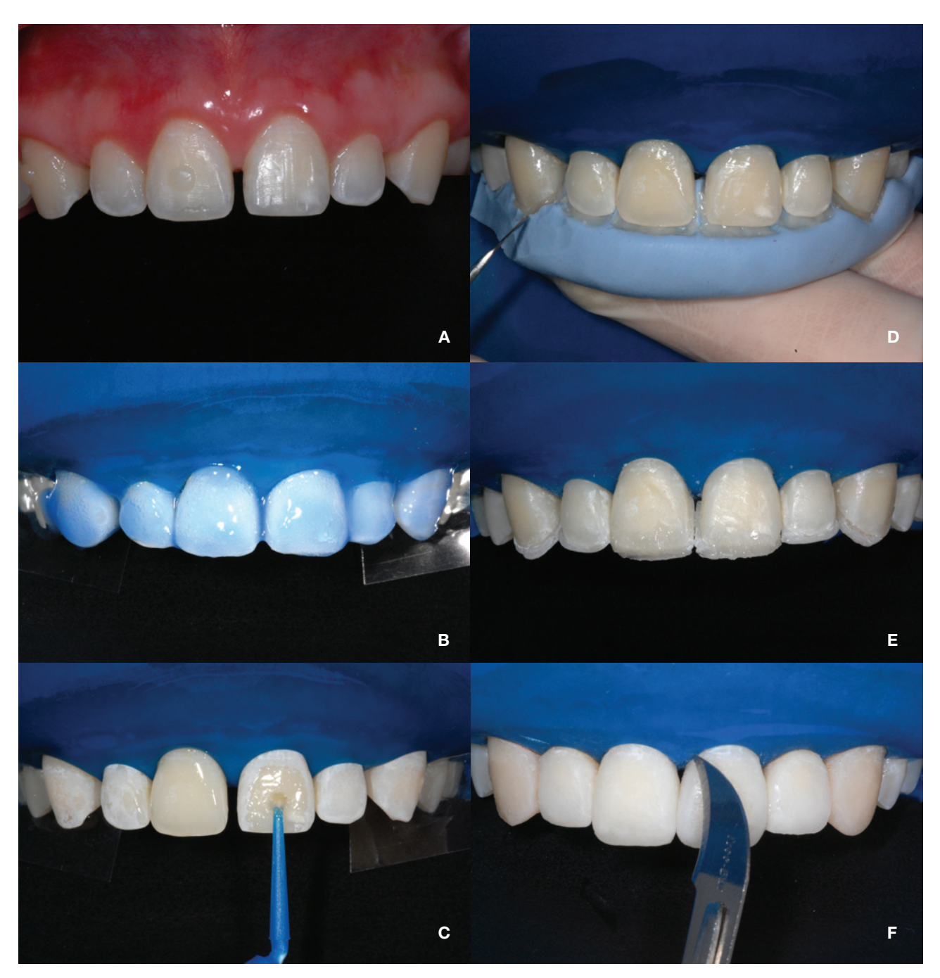
Figure 7 - a) Shade selection was performed by inserting the resin composite direct at the tooth surface. b) Etching with phosphoric acid for 30 seconds. c) The application of primer and adhesive with a disposable brush. d) Each increment of the composite was applied with a flat spatula, distributing it uniformly. e) Reproduction of the deepest artificial dentin with more opaque characteristics. f) The restorations were finished initially with a number 12 scalpel blade to remove gingival excess.