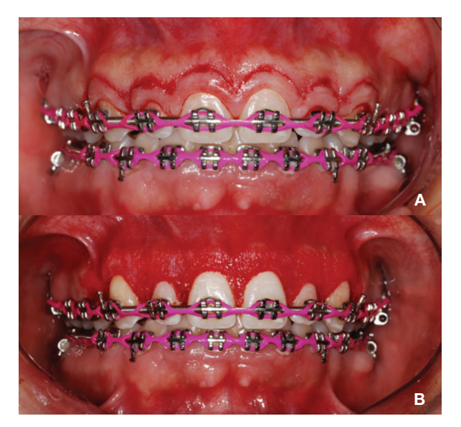
Figure 3 - a) Gingivoplasty technique in the maxillary arch. b) The final result after the procedure.