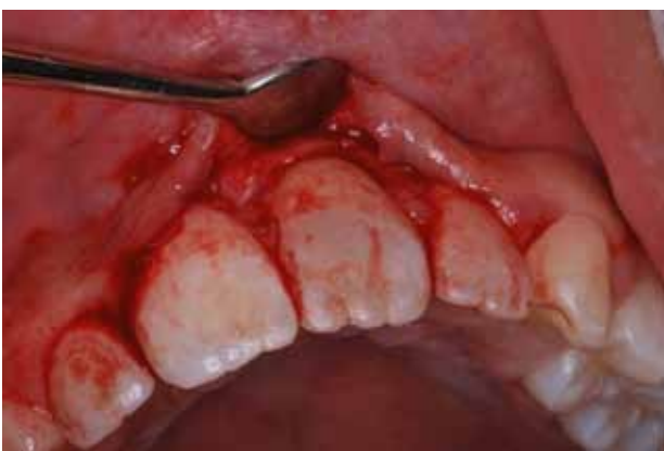
Figure 5 - Cortical bone exposure of the ankylosed tooth and its adjacent.