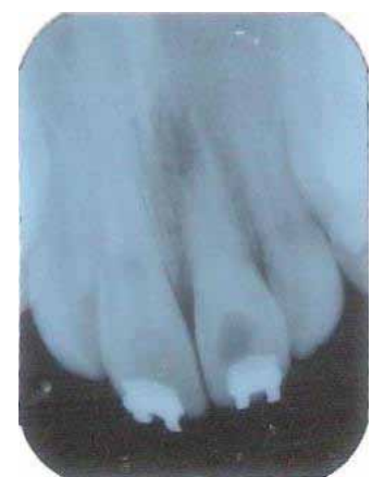
Figure 2 - Radiography showing the substitutive tooth resorption.