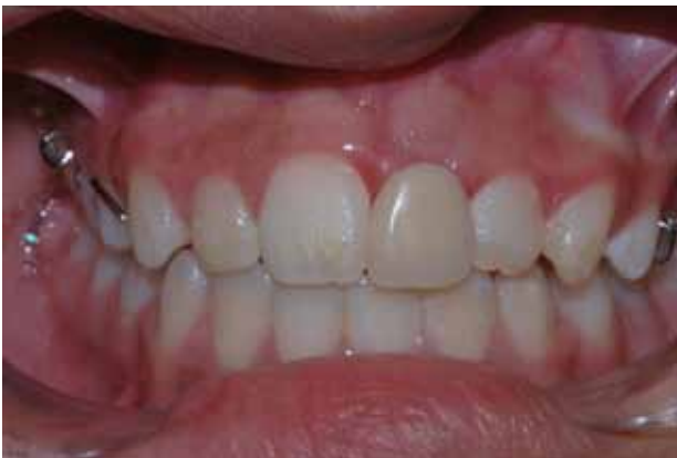
Figure 10 - Clinical evaluation 6 months after decoronation: verification of the adaptation of the aesthetic space maintainer.