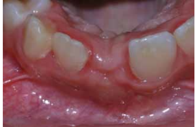
Figure 11 - Clinical evaluation 6 months after decoronation: verification of the condition of the alveolar ridge.