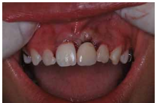
Figure 8 - Patient after surgery with aesthetic device already installed.