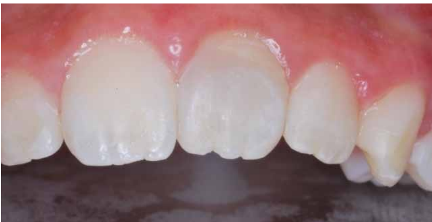
Figure 1 - Infra-position as a clinical sign of dental ankylosis [frontal view].

In the 6-month evaluation, radiographically, the buried root showed signs of resorption, but without bone loss. In fact, was possible to observe vertical bony ridge growth at the decoronation site [Figure 9]. The aesthetic space maintainer was still well adapted [Figure 10] and the alveolar ridge have no signals of inflammation or any other gingival or bony issues [Figure 11]. After three years, radiographic evaluation [Figure 12] showed complete root resorption and signs bone formation in root previous site.