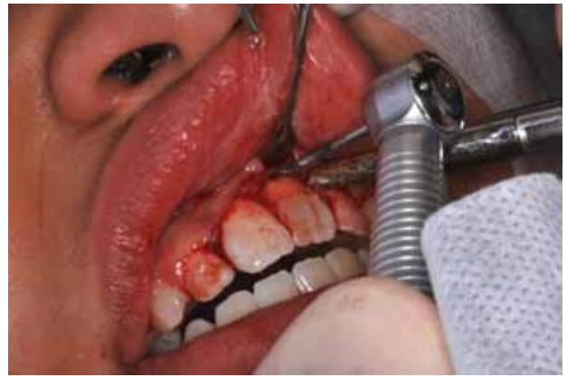
Figure 6 - Removal of dental crown with surgical drill # 702.