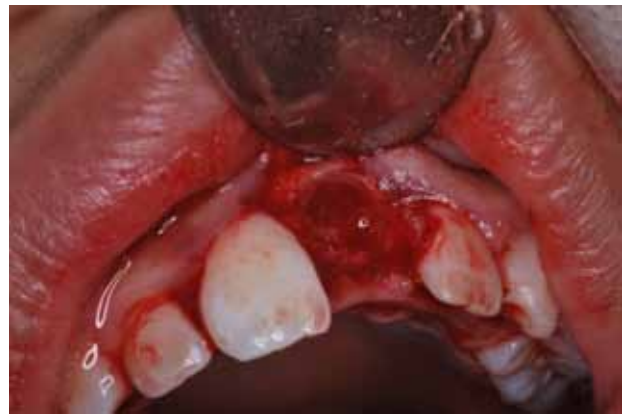
Figure 7 - Maintenance of blood clot.