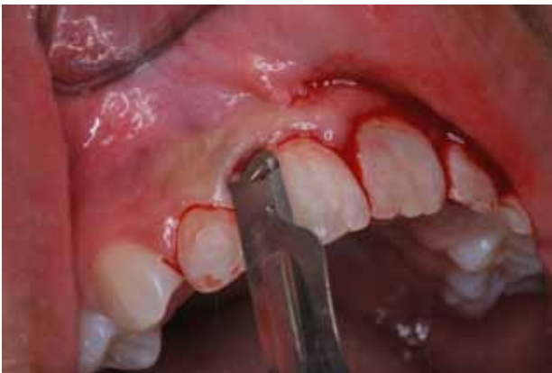
Figure 4 - Incision with blade n° 15.