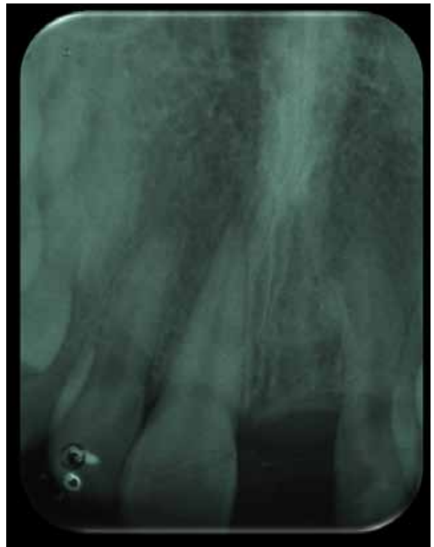
Figure 12 - Radiographic evaluation of root buried 3 years after decoronation.