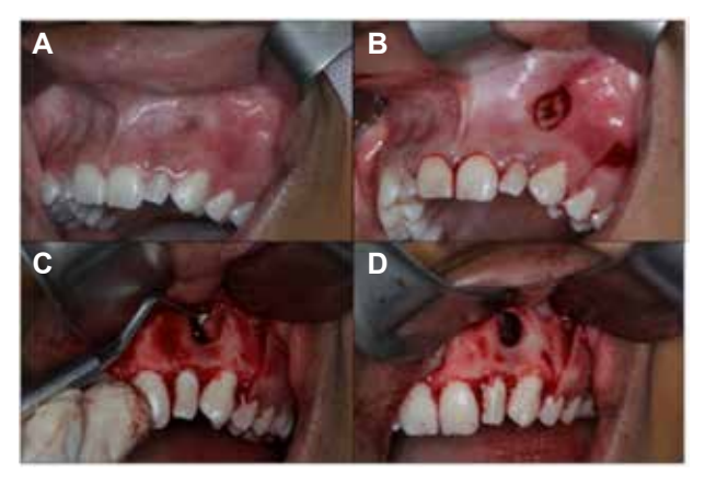
Figure 5 - Enucleation of the lesion. A. Intraoral clinical aspect one year after marsupialization, showing patency of the fistula. B. Fistulectomy and monoangular incision held for enucleation. C. Enucleation of the lesion with curettage. D. Clinical image after enucleation.