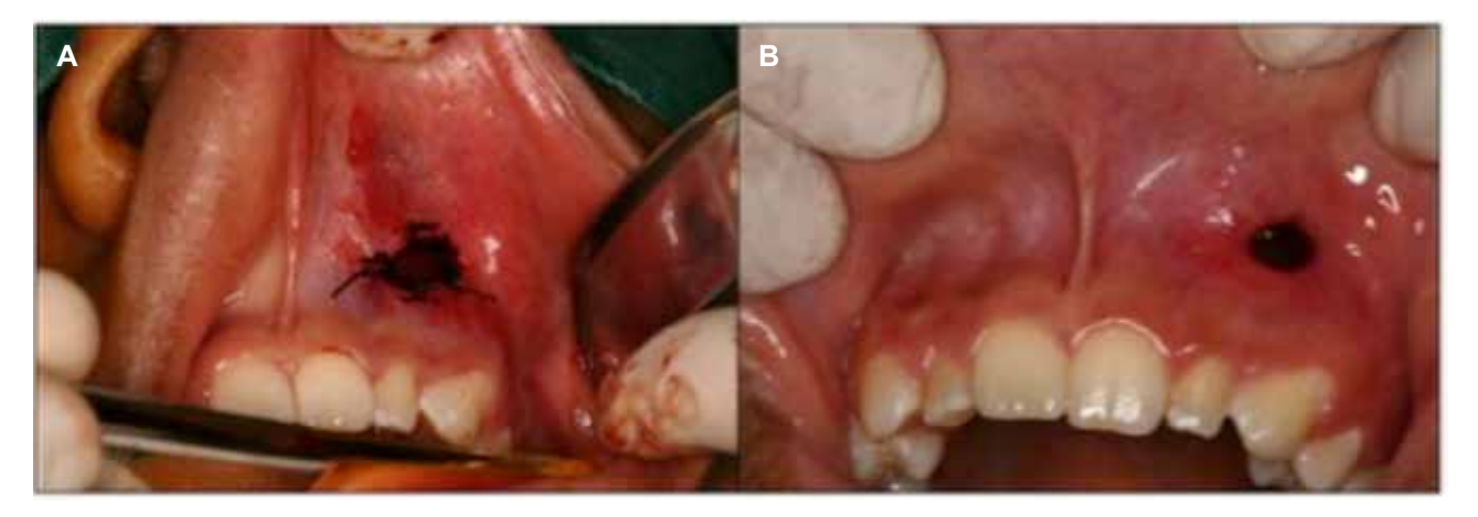
Figure 3 - A. Marsupialization of the lesion at buccal vestibule adjacent to the apex of tooth 22. B. Intraoral photography of 21 daypostoperative follow-up. Notice the good scarring and the presence of communication between the cystic cavity and the oral cavity.

The root canals were prepared with reciprocating system (VDW, Munich, Germany) with the file RECIPROC 25/.08 and irrigation/ aspiration with 2.5% sodium hypochlorite