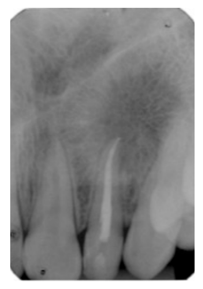
Figure 4 - Periapical radiograph performed 1 year after marsupialization. Notice adequate root canal filling [22] with regression of the cystic lesion related to the apex of tooth 22.

Follow-up took place after 1, 3, 6 and 12 months. After the root canal filling of tooth 22 and one year after the marsupialization, it was achieved a satisfactory reduction of the cystic lesion, allowing its complete enucleation. The resolution of the case can be evidenced by cone beam computed tomography 6 months after enucleation (Figure 6 e 7).