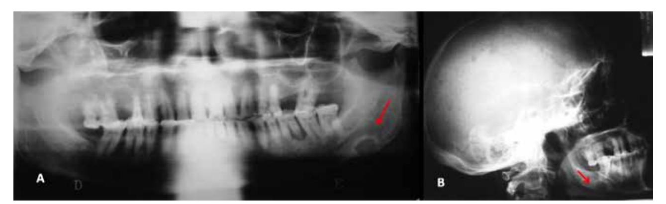
Figure 3 - a) Panoramic radiograph; b) lateral radiograph of face, showing a mandibular unilocular radiolucency (arrows) located above inferior dental canal.