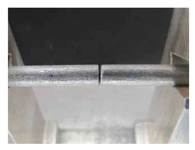
Figure 4 - The specimens attached to the device at a distance of 0.27 mm between endpoints.