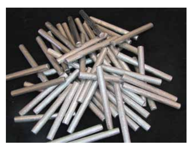
Figure 1 - Cylinders of Ni-Cr alloy.

The alloy employed in this study was Nickel-Chromium Wironia Light (Bego-Bremen - Germany). A total of 60 specimens alloy were prepared (4.0 mm in diameter and 35.0 mm in length), and two specimens alloy non-welded were used as control (4.0 mm in diameter and 70.0 mm in length). After casting, test specimens were divested and subjected to airborne particle abrasion with glass beads (CNG Soluções Protéticas - Brazil) at 55 PSI (Figure 1).