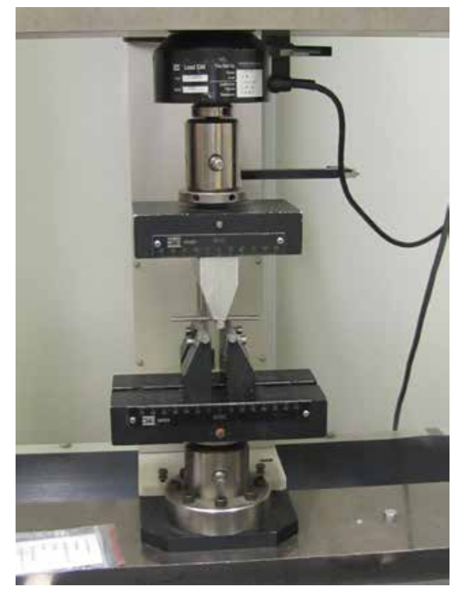
Figure 6 - Flexural strenght test carried out by means of a universal testing machine set at 0.5 mm/min.

After the flexural strength test was carried out, the lowest and highest values (expressed in Mpa) of welded specimens fracture, as well as the arithmetic mean of the samples in each group were as follows: Group A) 295.90, 769.40 and 553.80; Group B) 572.80, 942.90 and 751.00; Group C) 634.10, 893.70 and 802,13; and Group D) 1020.00, 1061.80 and 1040.90. Data were