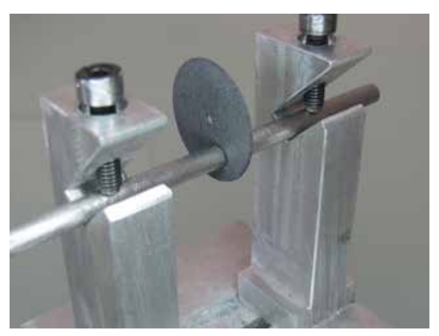
Figure 3 - Distance set on the basis of the width of carburundum discs.