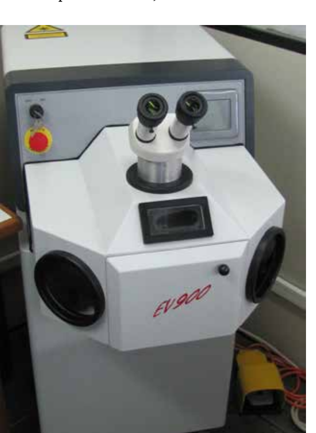
Figure 5 - EV-900 laser welder manufactured by Elettronica Valseriana.

Welding trials were performed by changing the laser beam current, frequency, time of exposure and diameter so as to establish its penetration at the center of the specimens. New trials were performed to determine the number of laser beam pulses necessary to cover the entire circumference. The best results were yielded with the following: 21 sites around the specimens, current of 200 A, frequency of 1.0 Hz, diameter of 0.5 mm and time of exposure of 3.0 ms. Based on these data, and by changing the electric current of the laser beam pulse in +/-20 A. Three groups were created, in which 20 specimens were welded as follows: Group A) 180 A, 1.0 Hz, 0.5 mm<sup>2</sup>, 3.0 ms and 4,7.106 J/ cm<sup>2</sup>; Group B) 200 A, 1.0 Hz, 0.5 mm<sup>2</sup>, 3.0 ms and 5,2.106 J/cm<sup>2</sup>; and Group C) 220 A; 1.0 Hz; 0.5 mm<sup>2</sup>, 3.0 ms and 5,8.106 J/cm<sup>2</sup>. Two specimens were not welded and comprised Group D) — the control. The period of exposition to laser beam in total/specimen was 0,063 seconds.