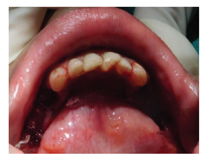
Figure 9 - Postoperative view of Mandibular arch