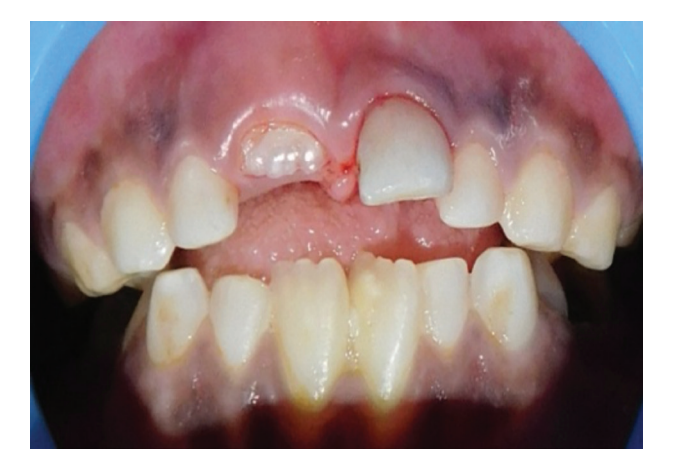
Figure 5 - White spot lesions on 31 and 41