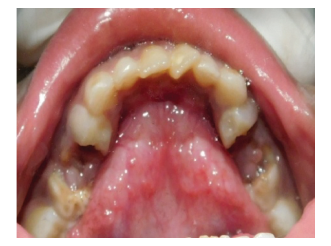
Figure 4 - Preoperative view of mandibular arch