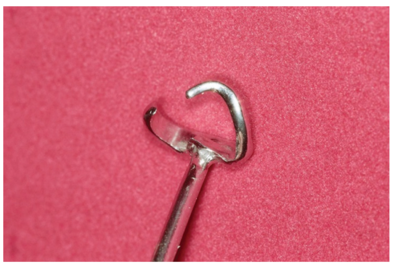
Figure 2 - Metallic clasp.