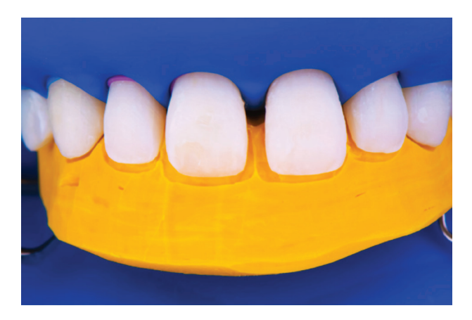
Figure 8 - Measurements from the 2D smile design were transferred to the cast and a diagnostic wax-up was produced to make a silicon guide.