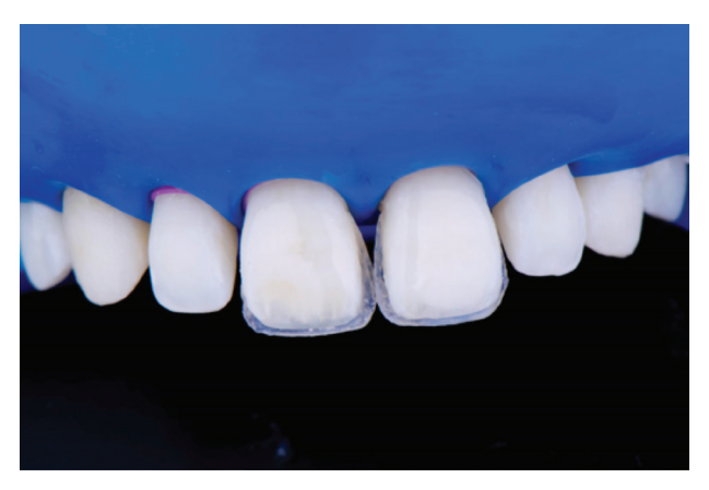
Figure 10 - The palatal wall is built with a thin layer of enamel composite resin.