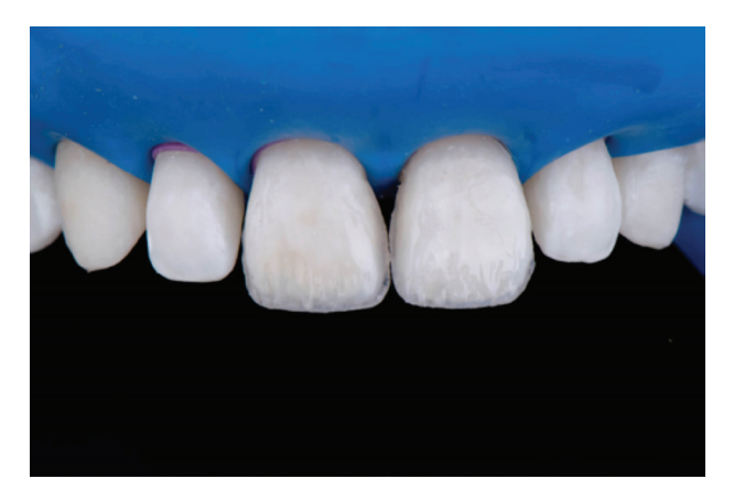
Figure 12 - To form the opacious body, dentine mass was applied: a thin layer of high saturation composite resin and a second layer to reproduce mamelons and intrinsic characteristics.

Finally, the finish layer of chromatic enamel resin composite was applied to the entire outer surface in a single increment, accommodated until it was adapted to all limits of the labial and proximal surfaces with a flat spatula (Figure 13). Next, a marten's hair brush (1021 no 2, Hotspot Design - 1021, Curitiba, Paraná, Brazil) was used to increase surface smoothness to obtain the necessary microtexture and adequate modelling, significantly reducing the finishing step.