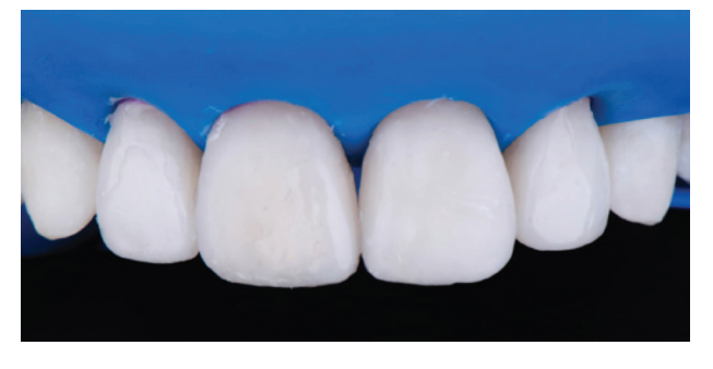
Figure 13 - Finish layer of chromatic enamel composite resin was applied to the entire outer surface.

Using a pencil, the labial surfaces of the teeth were divided into three thirds, and the width was measured for each one using a caliper to verify the size and symmetry of the homologous teeth by the distance between the transition lines and reflection angles (Figures 14 and 15). The outline of the mesial and distal light reflection lines of the labial surfaces were demarcated and repositioned by wear of the proximal region. Then, the contour of the incisal and cervical embrasures were performed. The distal angle of the incisal embrasures was made more rounded than the mesial angle because it is adequate for the anatomical characteristics of the female smile. In the finishing procedures, only intermediate grain discs were used (dark orange and light orange Sof-Lex, 3M ESPE, São Paulo, Brazil). It is important to ensure symmetrical proportion and integration of the restoration with the other teeth, observing the angle lines which divide the plane area of the large reflection light and shadow area which lies outside the angle lines and is rounded.