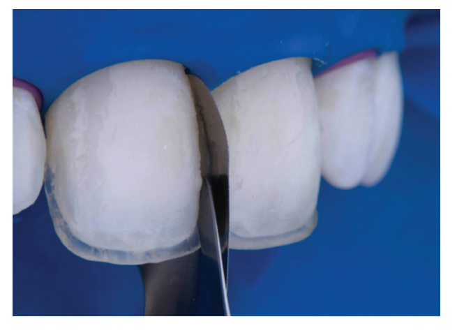
\ensuremath{\mbox{Figure 11}} - Interposition of unilateral matrix to build up the proximal wall.

Afterward, the limits of the tooth were well defined, especially in the cervical area, without excess. Then, to replicate the opacity of natural dentin, a thin layer of high saturation resin composite (A2 Dentin – Empress direct, Ivoclar Vivadent, Schaan, Liechtenstein) was applied on the entire tooth surface. A second layer of resin composite was applied at three specific points to reproduce mamelons and intrinsic characteristics (A1 Dentin – Empress direct, Ivoclar Vivadent, Schaan, Liechtenstein) (Figure 12). A small and thin cylinder of opaque resin composite was placed incisally in order to mimic the halo effect.