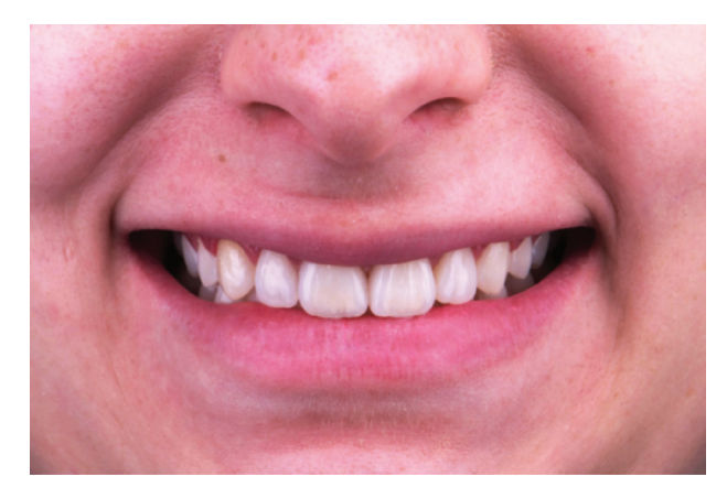
Figure 17 - One-week follow-up showing the final result of the smile.

In addition, it is mandatory to reproduce the macro and micro texture details which must be compatible with the age of the patient and the adjacent teeth. Thus, two depressions and subtle cervical markings were made using a diamod bur (no 3113 F – KG Sorensen, São Paulo, SP, Brazil) in low speed without water to have better control. Interproximal polishing was done with strips of sandpaper (KG