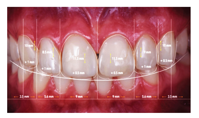
Figure 3 - Photographs according to the DSD protocol were obtained as well as diagnosis cast. Keynote was used to produce a 2D smile design and obtain the calibrated measurements for a 3D smile design.