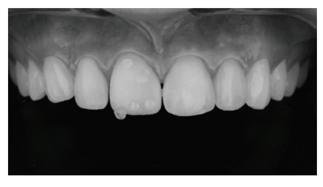
Figure 5 - Grayscale photography used for evaluation of value of the enamel composite resins.

After preparation, the remaining teeth structures were adequate to receive direct composite laminate veneer restorations. To remove old restorations, a high-speed handpiece under water cooling with the aid of fluorescent light was used to highlight the restorative material and minimize enamel reduction (Figures 6 and 7).