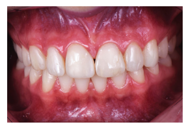
Figure 2 - Incongruous restoration of 1.1, 1.2, 1.3, 2.1, 2.2, 2.3, with wrong shape, unnatural color and marginal over contours.