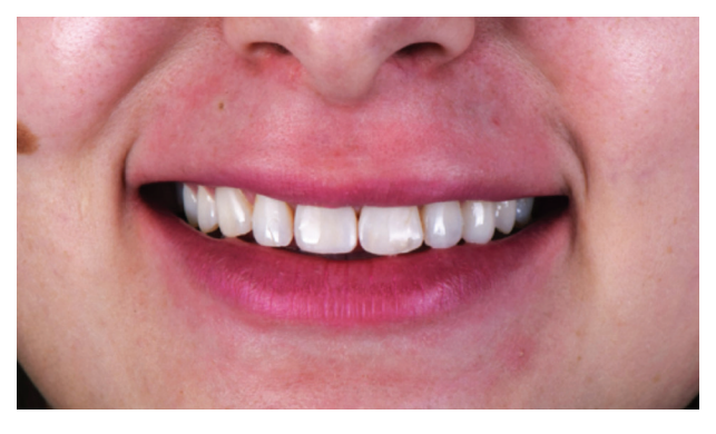
Figure 1 - Preoperative frontal view of the smile.

effect at the incisal edge amongst the precise demarcations of dentin extensions through the enamel. Additionally, grayscale and crosspolarized photographs were taken to evaluate the basic color (hue), saturation (chroma) and brightness (value) (Figure 5).