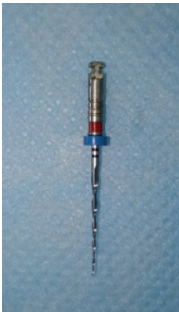
Figure 2 - MTwo file system.