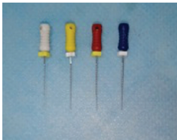
Figure 1 - K files.

The parents /guardians were instructed on how to use the pain scale and were advised to record the pain status every 6, 12, 24, 48 and 72 hours. All the parents/caregivers were blinded of the treatment protocol used. Postoperative pain was measured using a four-point pain intensity scale (Figure 4). [2] The pain scale is interpreted as : (1) zero- no pain, (2) one- slight pain, (3) two- moderate pain, (4) three- severe pain. The findings were recorded by the parents and also by the operator over telephone conversation after 6 , 12 , 24 , 48 and 72 hours. The statistical analysis was done using SPSS software (IBM Corp, Armonk, NY, USA). Chi-Square test was used to compare the proportion of pain between all the three groups.