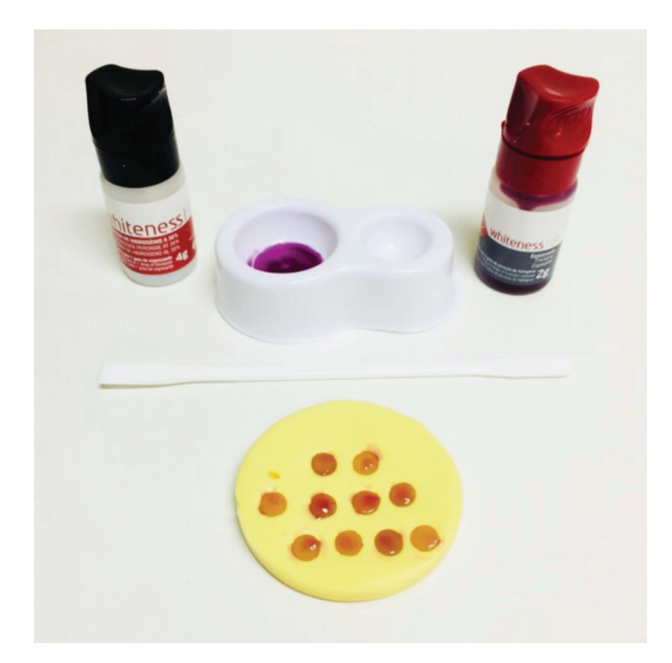
Figure 2 - 35% Hydrogen peroxide-based bleach: Bottles (hydrogen peroxide on the left, thickener on the right), contents of the jars homogenized in gel (top center), and gel applied to the samples.