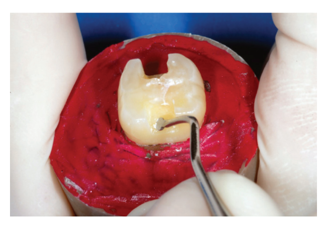
Figure 1 - Spoon excavator preparing the ART cavity.

After completion of the cavities, the teeth were divided into two groups of 10 teeth each, which were restored with the two materials being tested.