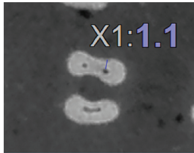
Figure 3 - Measurement of mesial and distal distances from the root to canal with no instrumentation.

Using NNT viewer 6.1.0 (New Tom, QR S.r.l.Co., Verona, Italy) software, axial images were displayed beside each other to measure dentinal thicknesses in scan before and after instrumentation at the same time and we could achieve length sizes of 3, 5, 7, 9 and 11 mm of apex by playing up or down these images and calibrations were done and canal transportation was calculated (Figures 3 to 6).