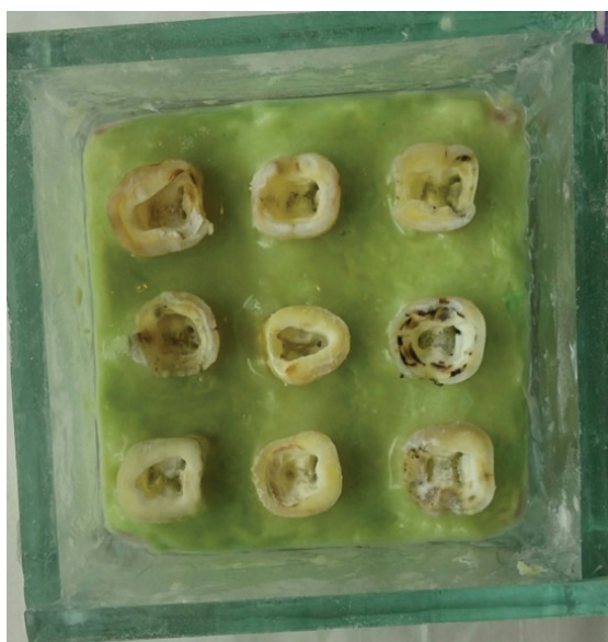
Figure 1 - Teeth mounted on the jig (18 mm).

technique was reported. one line trace parallel to the tooth long axis and The Second line starts from apex so that to cross with the first line on a curve of the canal [25]. Crown of teeth was measured up to length of 18mm from apex and cut by a diamond disk (Switzerland, Topsent). The length workening was determined 1mm less than this value for all teeth. Teeth were randomly divided into two groups including 25 teeth with RaCe file (first group) and 25 teeth with Neoniti file (second group). On the surface of the glassy jig with dimensions of 6×6cm [26] a wax layer was put so that apex of teeth not to be exposed to the glass. Then, samples were placed in triple rows and mounted by acrylic resin (Acropars, Marlic Dental, Iran). Teeth were totally mounted in 6 jigs (Figure 1). After selection and cleaning teeth from residual soft tissue and callus, teeth were clinically evaluated to absence of external reabsorption, severe extended carious to the root surface, root fracture and mature apex. Afterwards, teeth were located in formalin (10%) for disinfection and maintenance of conditions of samples. Cavity Access was prepared by high speed rotary instrument. An Orifice of canals was found by K \neq 10 file. Figure 2 shows teeth with the canals in which curvature is 15-30 degree with at least 18mm as selected length.