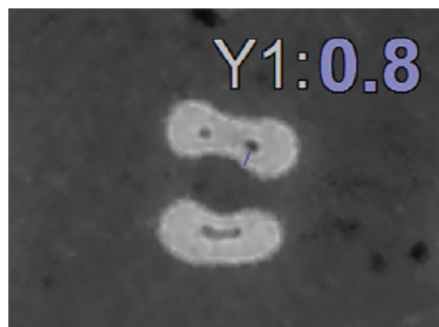
Figure 4 - Measurement of mesial and distal distances from the root to canal with instrumentation.