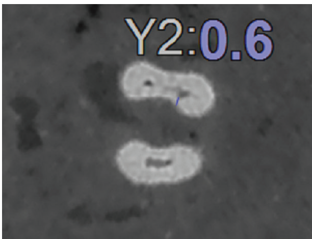
Figure 6 - Measurement of mesial and distal distances from the root to canal with no instrumentation.

The data obtained from the present study were analyzed by descriptive and inferential statistics in two parts. In the section of descriptive statistics, criteria such as central tendency and dispersion were reported with the table. In inferential statistic part, the normality of data was analyzed using the Kolmogorov-Smirnov test. With respect to the normal distribution of data ( p\text{-value} > 0.05 ) and for comparison between two files, Independent T-test (two samples) was employed. Likewise, in order to compare canal transportation within different distances from an apex, repeated measures test was