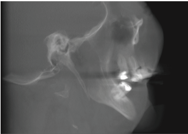
Figure 1 - Sagittal section of the cone beam computed tomography showing the calcification of the styloid process.

For statistical purposes, data were analyzed and all the findings were tabulated, taking into account the incidence side, gender, age group of individuals and types of dystrophic, idiopathic and metastatic calcification, being submitted to descriptive statistics.