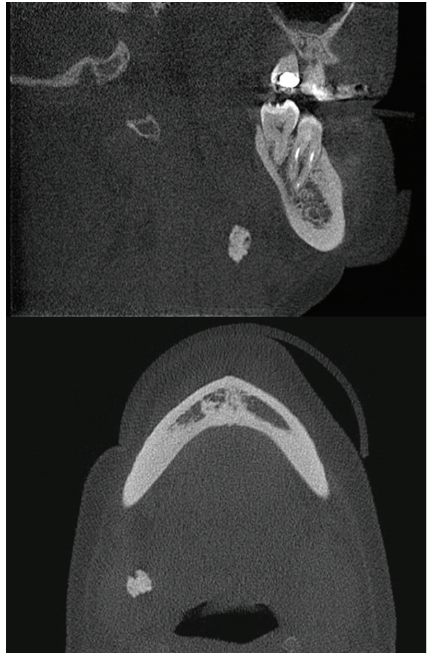
Figure 3 - Sagittal views (A) and axial views (B) of the cone beam computed tomography showing the calcified lymph nodes.