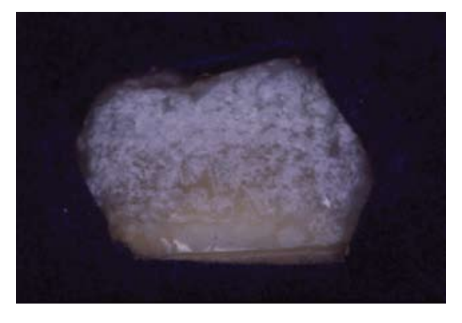
FIGURE 2 - Aspect of the enamel soon after Er:YAG laser irradiation.