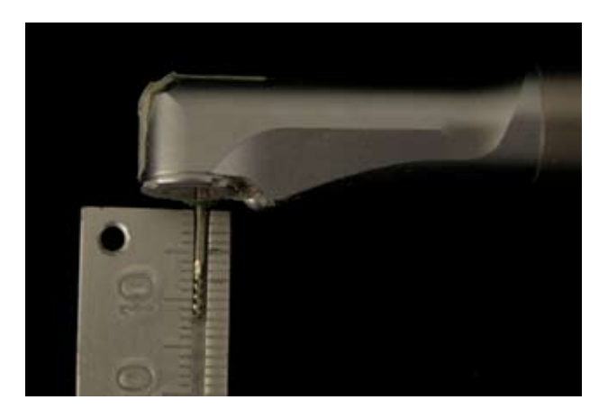
FIGURE 3 - Adapted endodontic K-File fixed in hand piece.

distance of 12 mm from the tooth surface to the apparatus lens. After the enamel irradiation, the region was conditioned with 37% phosphoric acid for 30 seconds and water rinsed for 1 minute. Soon after the acid conditioning, the adhesive agent Single Bond (3M ESPE) was applied on the surface and photopolymerized according to the manufacturer instructions.