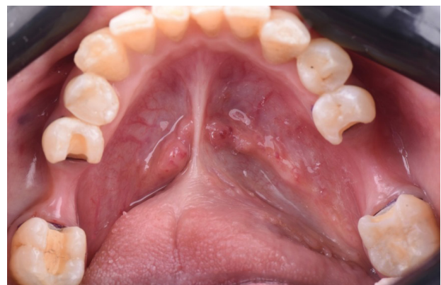
Figure 1 - Representative preparation photo of both groups, a proximal box design (left side) and inlay shaped design (right side).

The selected PMMA resin disk of the required size was inserted into the Roland DWX-50 milling machine (Roland DGA Corporation, California) and the spindle was fastened with the set screw [11]. The resin restoration was checked