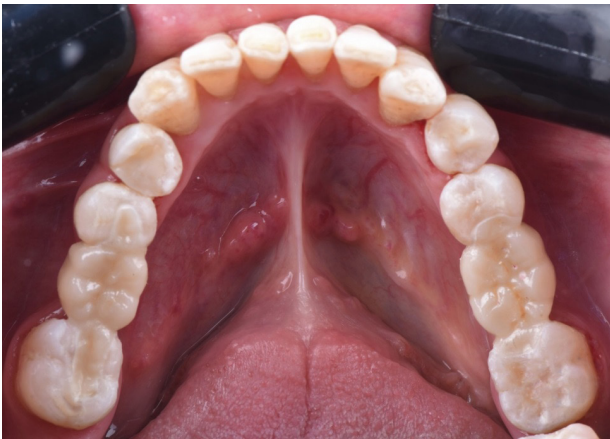
Figure 3 - Inlay retained bridges after the final cementation.

caries, and gingivitis was done immediately after cementation, one month, three months, six months, nine months, and twelve months. This was done by using the MUSPHS criteria [13].