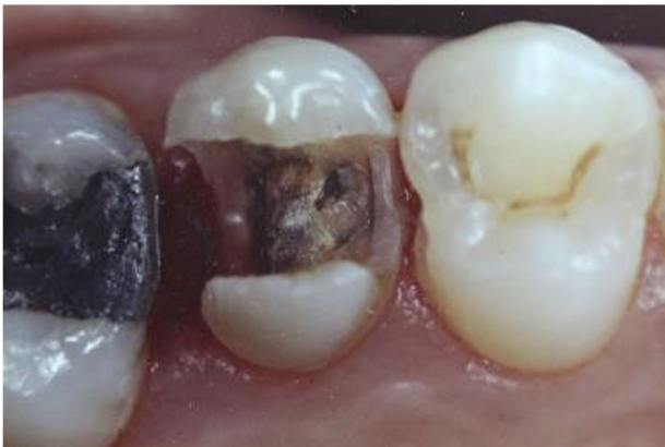
Figure 2 - Amalgam restoration on tooth 26; replacement of amalgam restoration with composite being performed on tooth 25; caries lesion on the distal of tooth 24.

After this patch test's result and with the patient's consent, all restorations were changed and composite resin restorations were performed. The material chosen for replacement of the