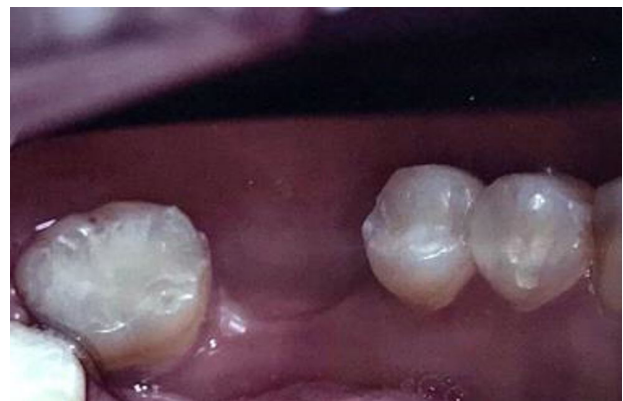
Figure 4 - Clinical features immediately after replacement of the restorations.

Nevertheless, after 25 years of follow-up it was observed that burning sensation has never been felt anymore (Figure 7).