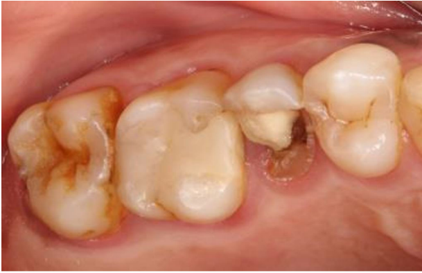
Figure 6 - Clinical features after 25 years (teeth 24, 25): some periodontal problems, teeth fractured, caries lesions.