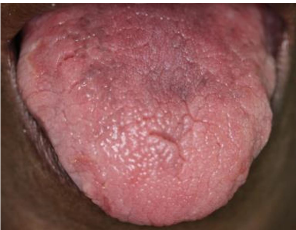
Figure 7 - Clinical features of tongue after 25 years: burning sensation has never been felt anymore.