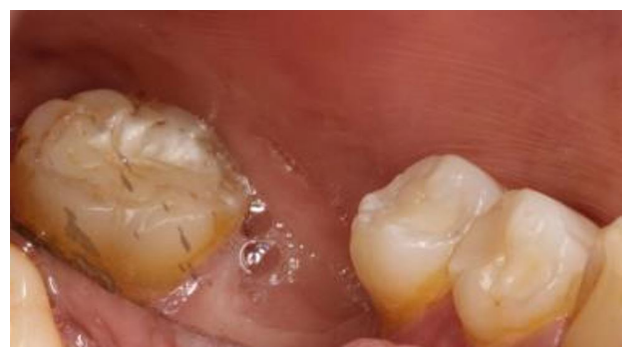
Figure 5 - Clinical features of resin restorations after 25 years of longevity.