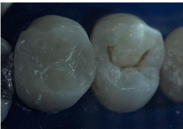
Figure 3 - Clinical features immediately after restorations on teeth 24 and 25.

restorations was the composite resin Z100 (3M) (Figure 3, 4).