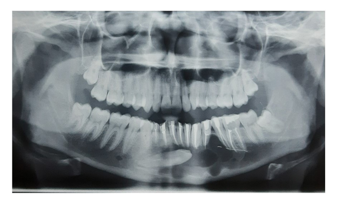
Figure 1 - Pre-operative pantomogram showing multilocular OKC involving anterior mandible and left side body, impacted canine is also seen.