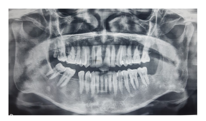
Figure 5 - Four years post-operative pantomogram showing complete ossification of bone, no radiographical signs of recurrence can be seen.