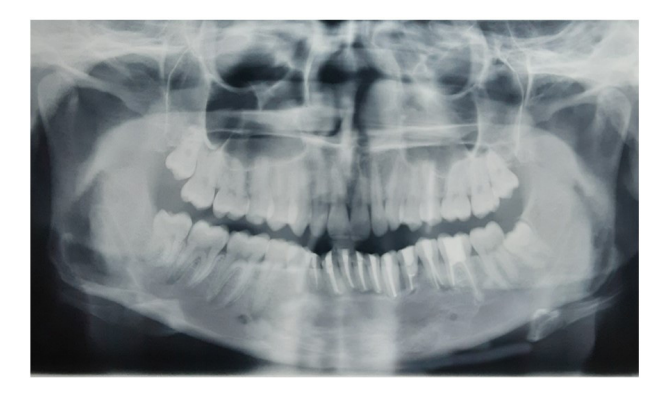
Figure 3 - Five years post-operative pantomogram showing complete ossification of bone, no radiographical signs of recurrence can be seen.

4 involved anterior region, whereas 5 lesions were located in maxilla, out of which 3 involved anterior region and 2 involved posterior region. All patients were followed up for four to five years, post-operatively. None of the cases showed any recurrence throughout the period of follow-up, which might be indicative of the presented protocol being an effective option. Paraesthesia for a maximum of 6 weeks was noted in four patients and wound dehicence in three, no other complications were noted (Table I).