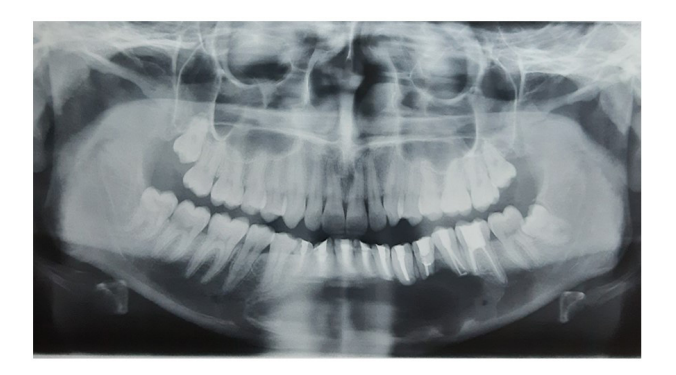
Figure 2 - Three months post-operative pantomogram showing persistant mandibular radiolucency, no radiographical signs of recurrence.

Table I - Patient's pre and post-operative data