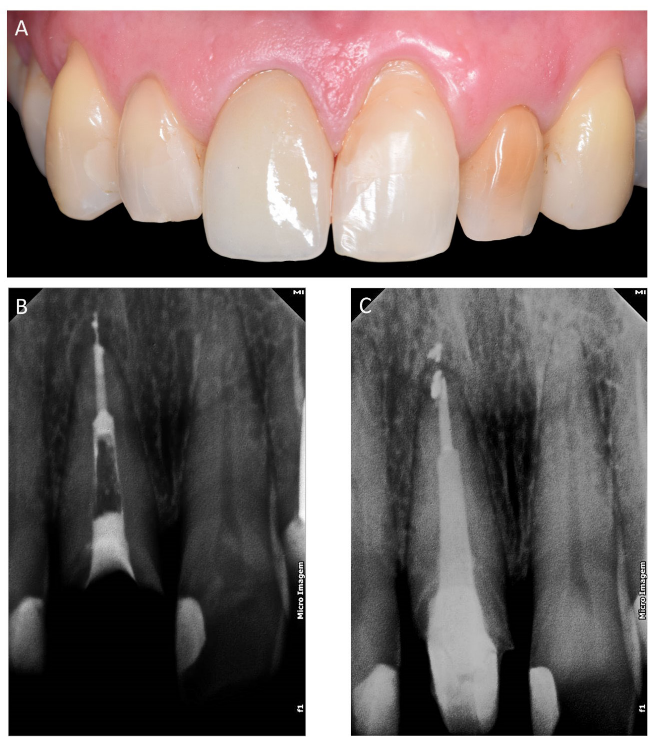
Figure 4 - Crown cementation and follow-up sessions. (A) intraoral image immediately after the crown cementation; (B) periapical radiography immediately after the obturation; (C) periapical radiography at one-year follow-up session.

the accuracy of guided endodontic access and thus to assure a homogenic tridimensional cone preparation [24].