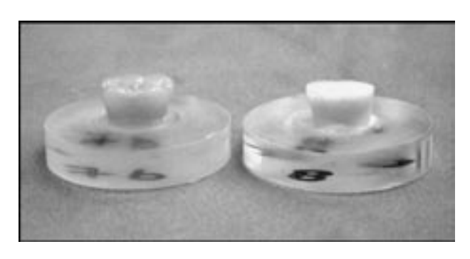
FIGURE 4 - Illustration of the samples before and after abrasion test.