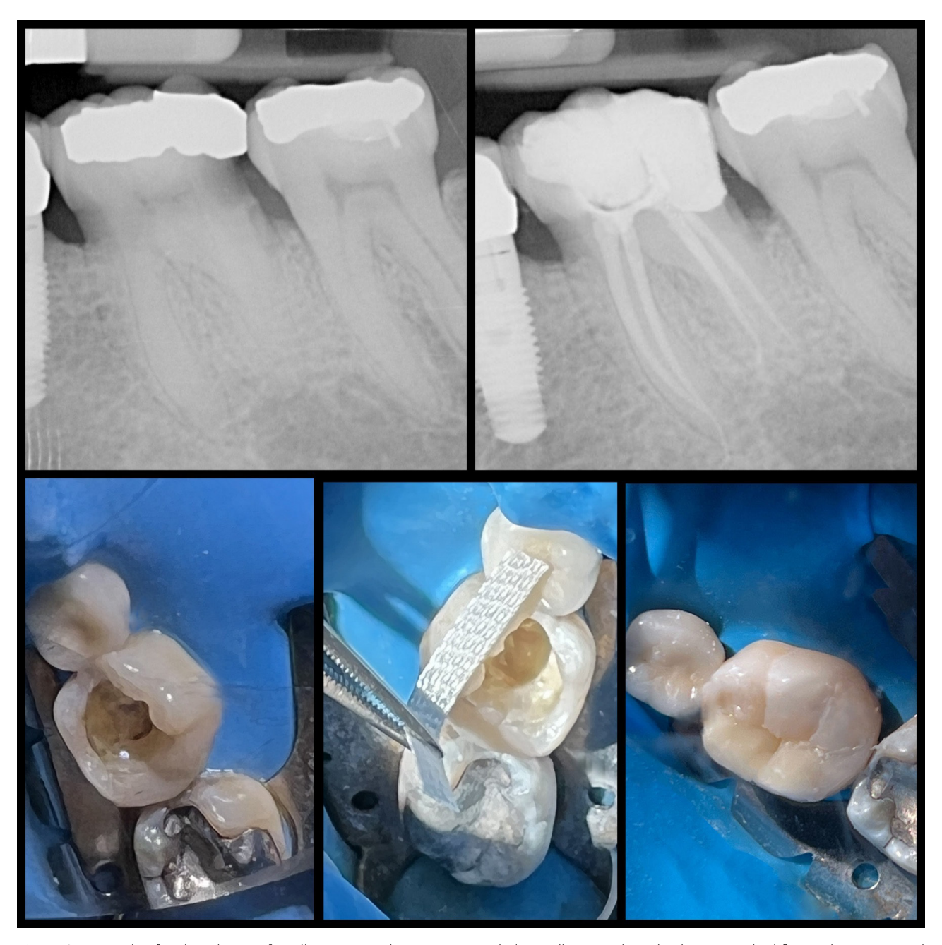
Figure 2 - Example of a clinical case of "wallpapering technique" in an endodontically treated tooth. The patient had financial concerns and could not afford a crown coverage. To improve the probability of success, a polyethylene fiber was adapted within all walls of the cavity and the tooth was restored with composite.

by providing a highly compressible ceramic framework over the height of contour which mimics the natural enamel compression dome, while preserving the healthy tooth structure below the height of contour, or biorim (Figure 3) [53].